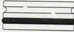
COMPLETION PLUG (SIDE VIEW)